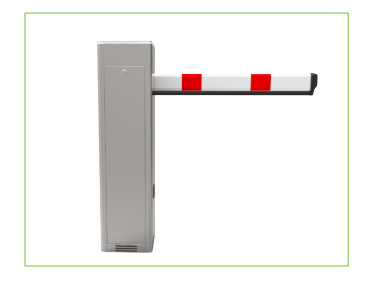
PB Series Automatic Barrier